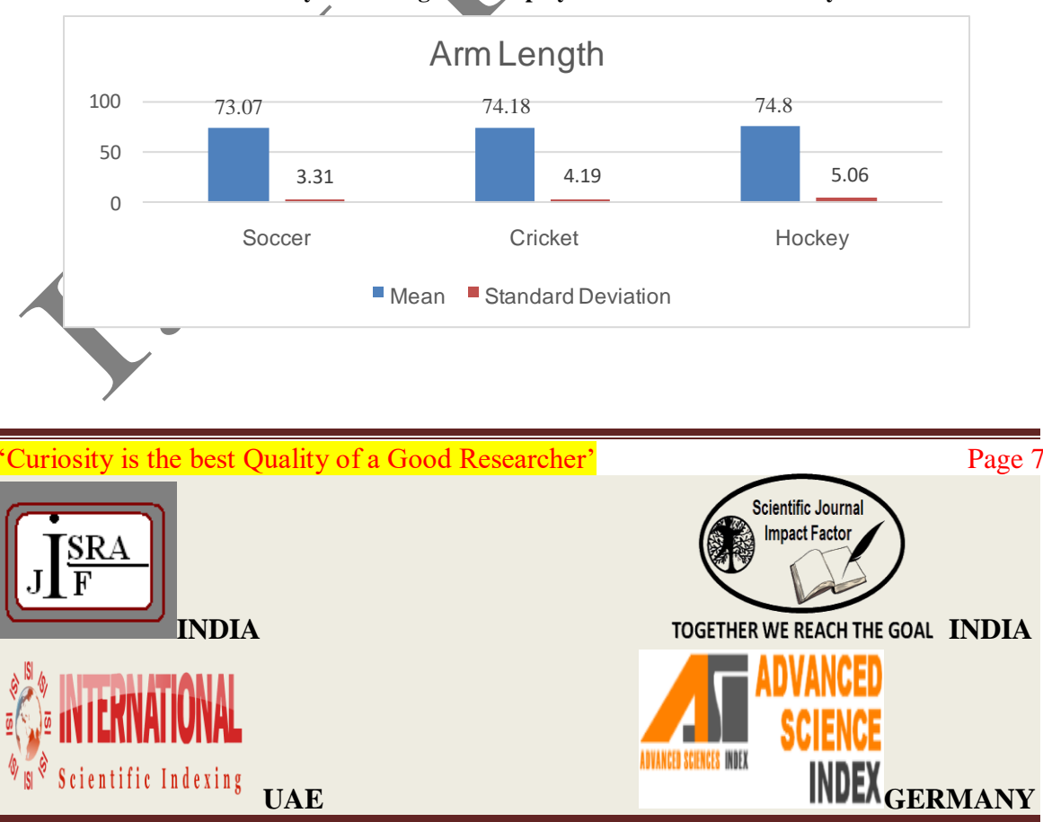
Figure-3 The graphical representation of mean and standard deviation of Arm Length of male Soccer, Cricket and Hockey intercollegiate level players of H.N.B.G. University

Table –3. Reveals that the mean score of Cricket players are lowest while Soccer players has the highest mean value on Arm Length. Standard deviation of Soccer players has lowest value while Hockey players has the highest standard deviation in scores.